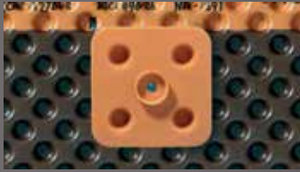
DELTA®-FAST'ner multistud fastener for secure attachment of DELTA®-MS.

Dörken makes your life easier – systematically.