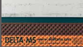
DELTA®-FLASH angled flashing used at top of flat tab.