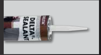
DELTA®-SEALANT elastic sealing compound used at overlaps and penetrations.

DELTA® is a registered trademark of Ewald Dörken AG, Herdecke, Germany.