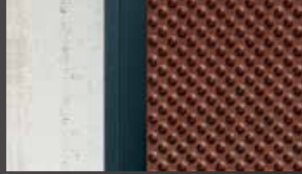
DELTA®-MOLDSTRIP molding used around window cut-outs and at grade level/changes.